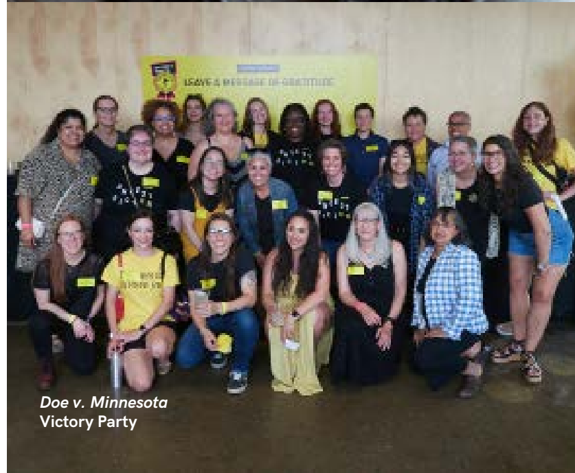
Doe v. Minnesota Victory Party